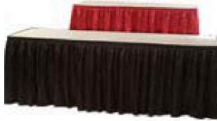
Table Skirt Color: _____ blue _____ red _____ burgundy _____ black _____ green _____ yellow _____ white